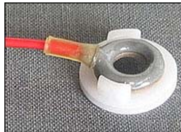
Electrode and Electrode in harness.